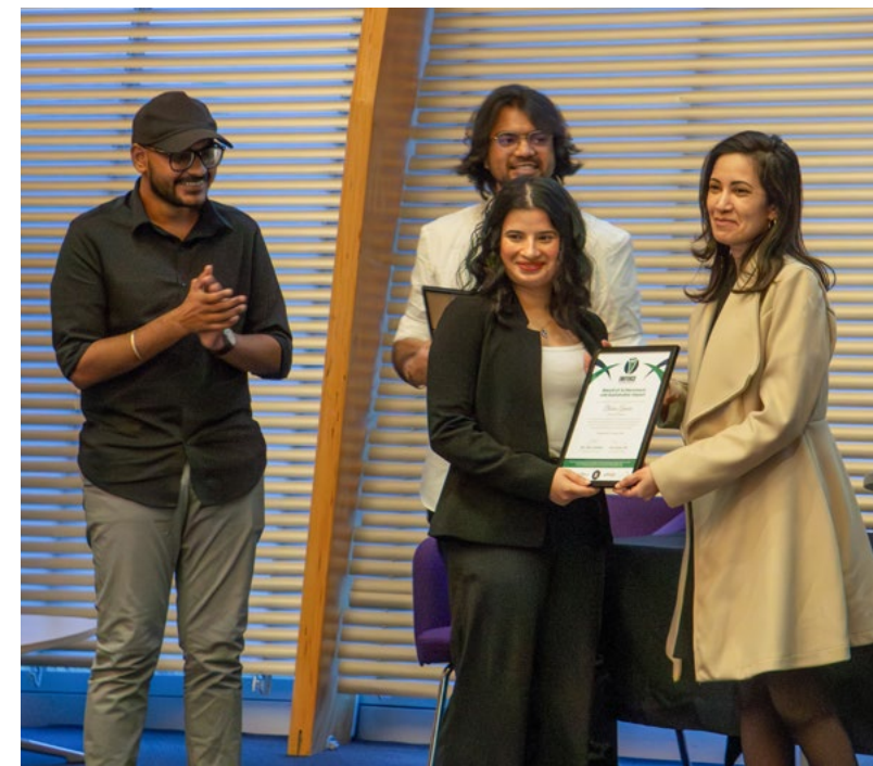
Uniforce Awards Ceremony