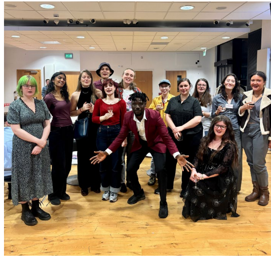
Napier Student Film Festival