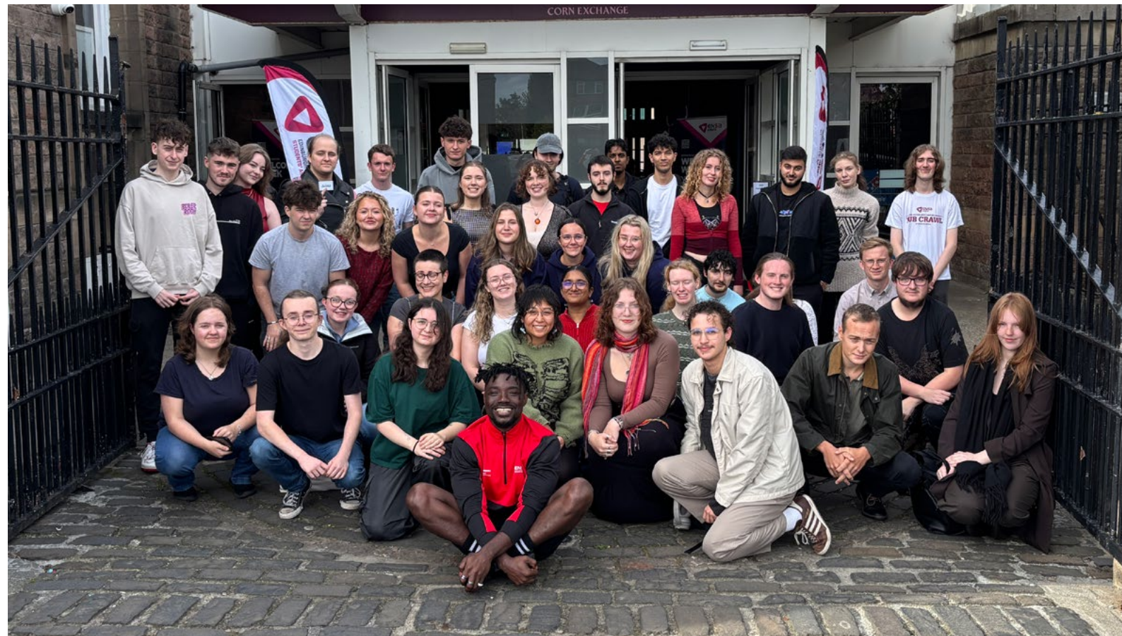
Societies at Welcome Fair