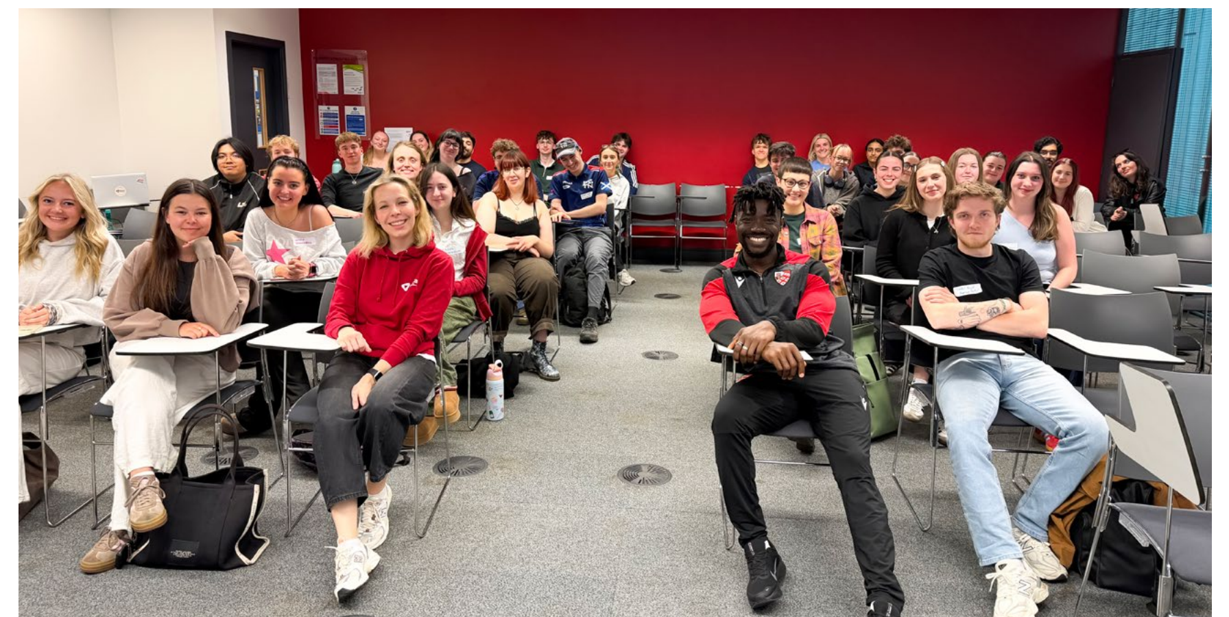
Sports & Societies Committee Conference