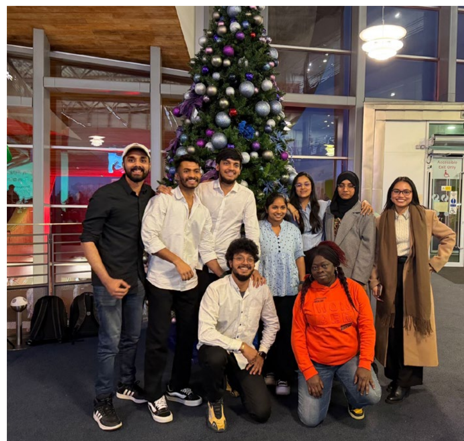
Tree Lighting Fest