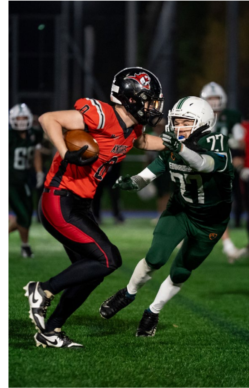
League Winners - Napier Knights