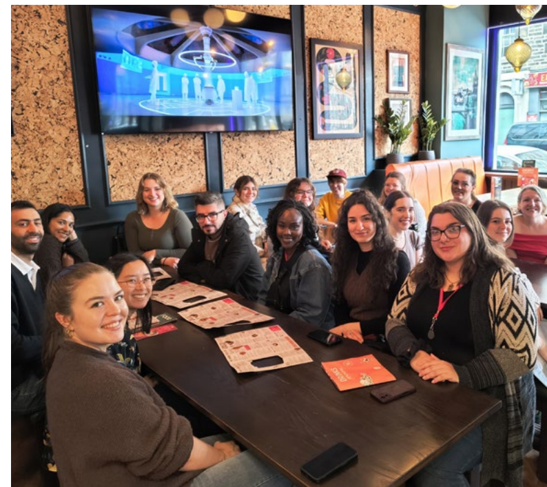
Welcome Week Postgrads' Brunch