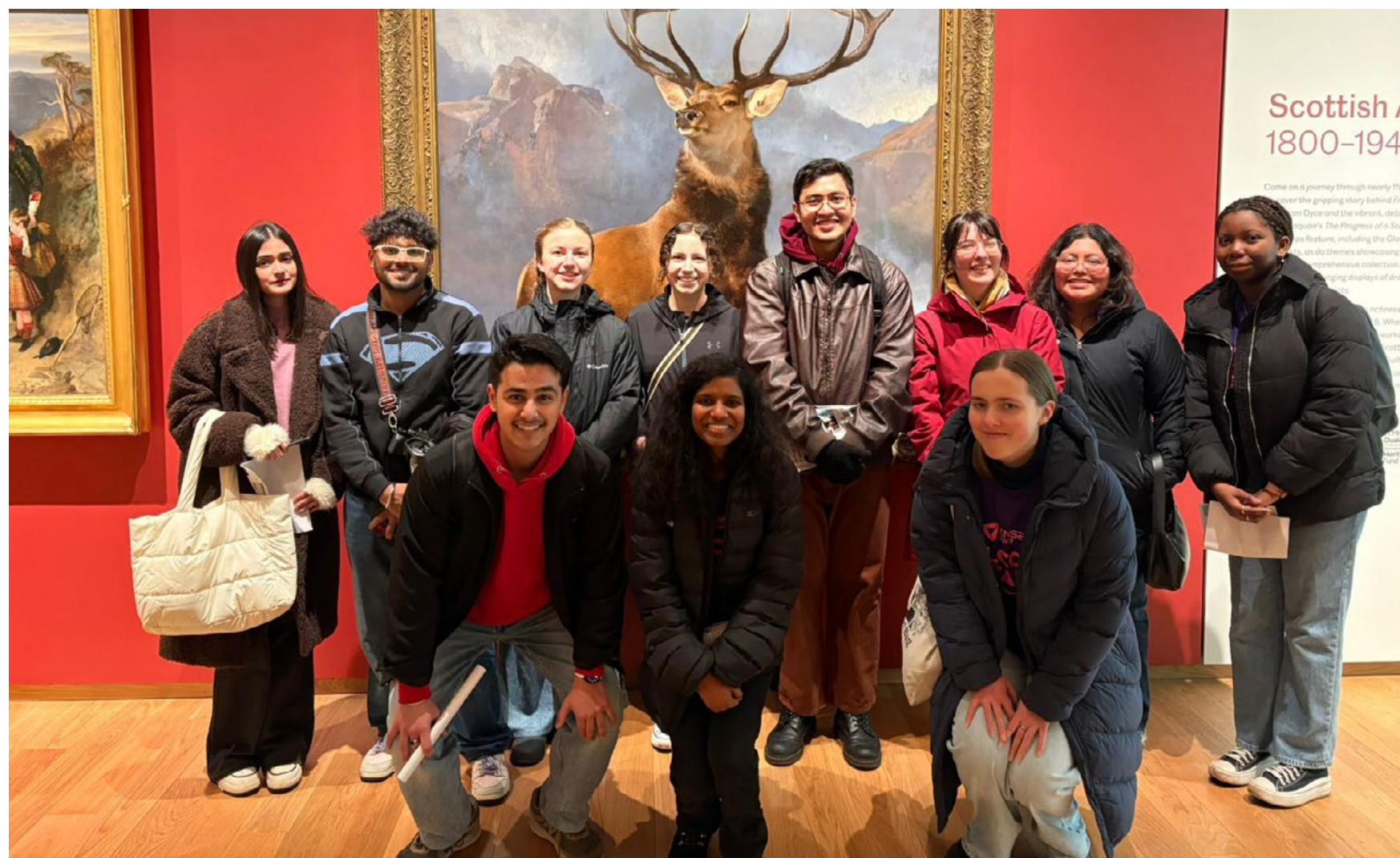
Welcome Back Week Culture Crawl