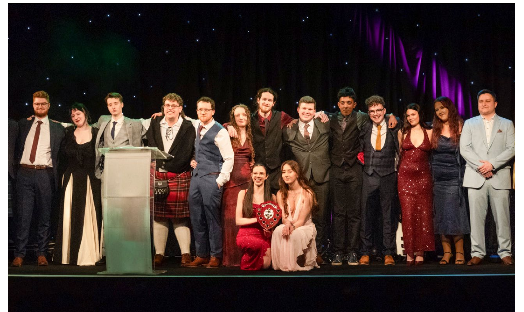
Society of the Year at the Awards Ball - Formula Student