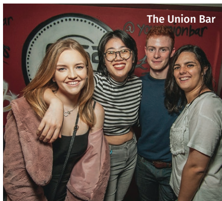
The Union Bar @ your union bar